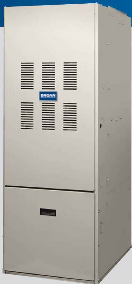
HIGH BOY/FIXED- AND VARIABLE-SPEED