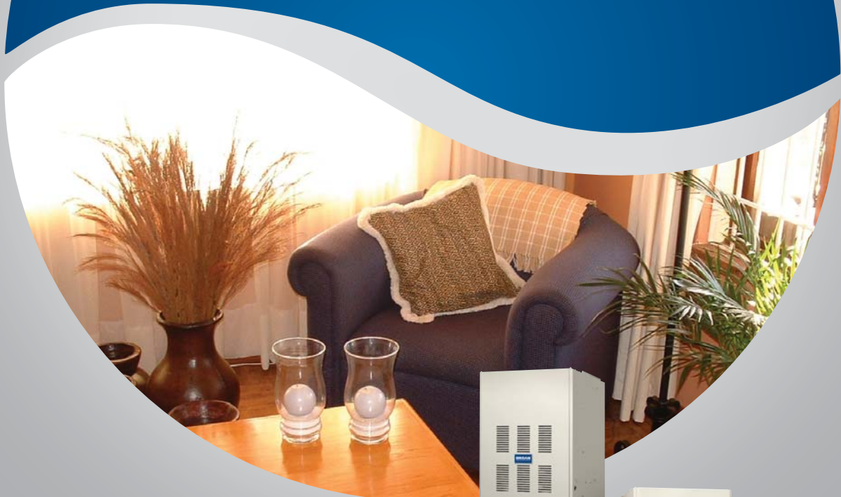
SINGLE-STAGE OIL FURNACES

Innovation, dependability and total comfort